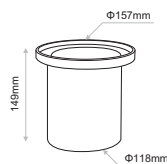
ACC.232 Recessed Housing Box